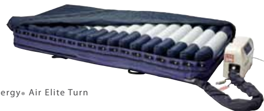
Synergy® Air Elite Turn